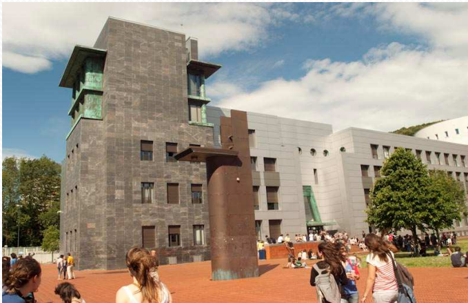
Dual ADE Gipuzkoa