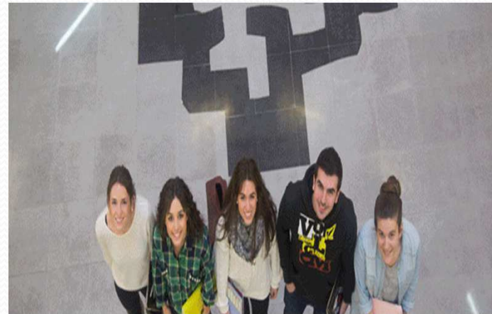
Dual ADE Bizkaia